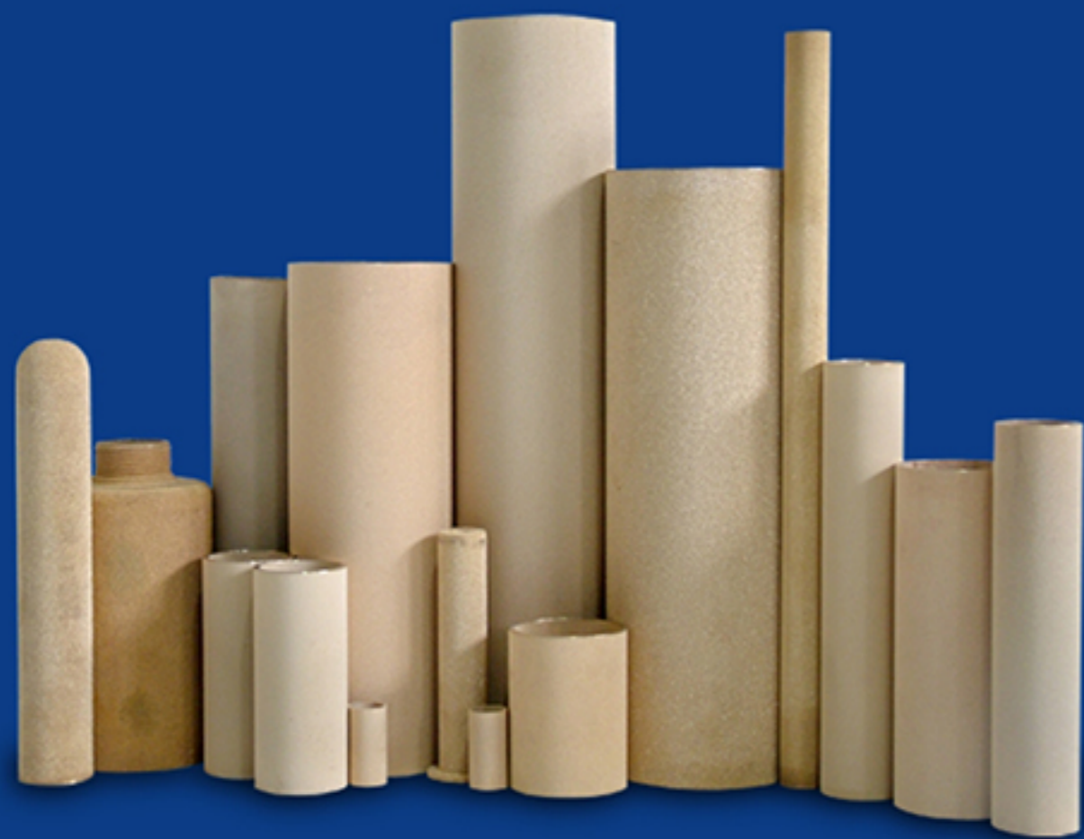
Sinter cevi - Hollow cylinder