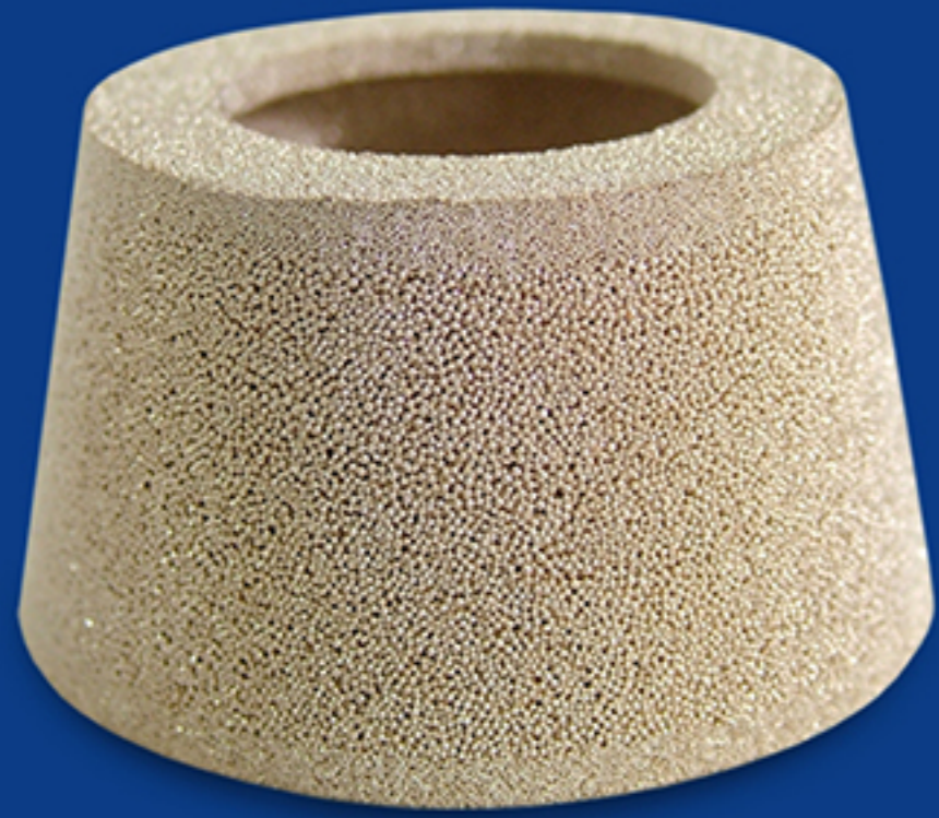
Konusni delovi Conical moulds